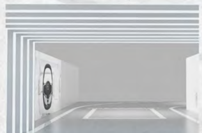
3 Learn about the EX30's tech and features in an interactive car ride