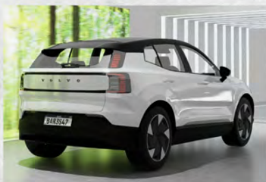
2 See, touch, hear, and feel the EX30 in person