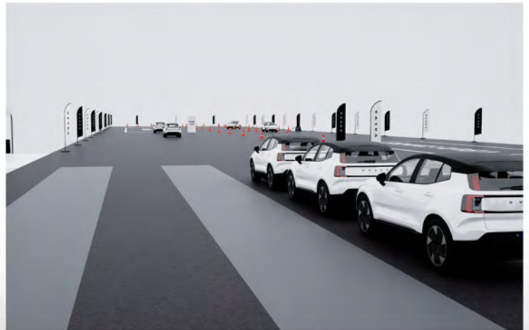
4 Experience the EX30's acceleration and handling on the tarmac