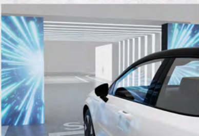
1 Understand the little thoughts that make a big impact with the EX30