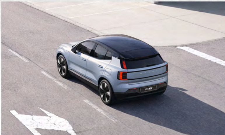
5 Take the EX30 for a test drive on real, busy city roads